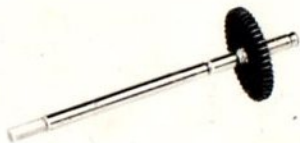
Part No. 31050 AXLE WITH TOOTHED WHEEL 50mm Quantity 5